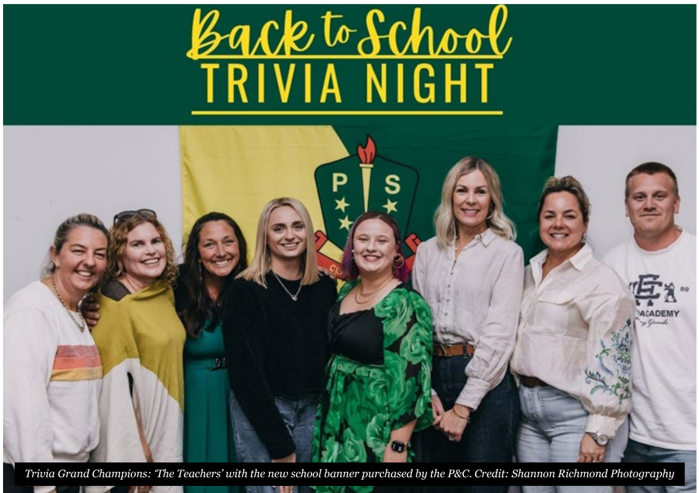
Trivia Grand Champions: 'The Teachers' with the new school banner purchased by the P&C.