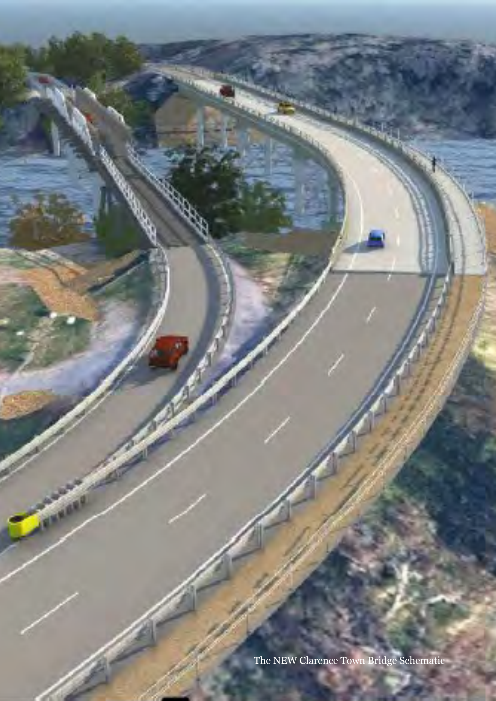
The NEW Clarence Town Bridge Schematic