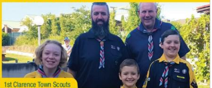
1st Clarence Town Scouts