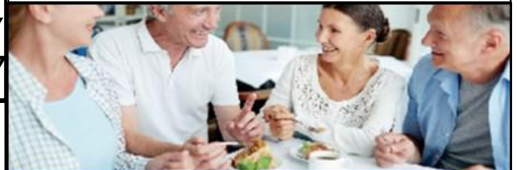
CLARENCE TOWN SENIOR CITIZENS DAY CARE CENTRE INC.