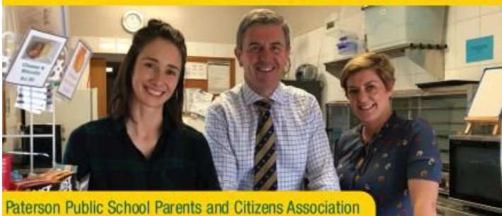
Paterson Public School Parents and Citizens Association